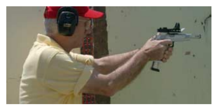
As the pistol is punched toward the target, your eyes are initially focused on the target. When the pistol reaches the full extension, your eye focus must shift to the front sight.

5) As the sights become aligned on the target, the trigger press begins and the pistol fires with a 'surprise break' to the trigger.