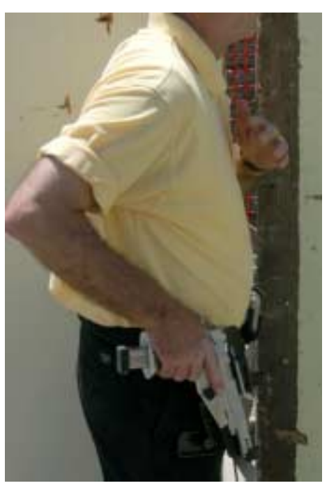
safety comes off, and the finger moves toward the trigger.

5) As the sights become aligned on the target, the trigger press begins and the pistol fires with a 'surprise break' to the trigger.